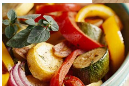
Roasted summer vegetables with Italian Seasoning