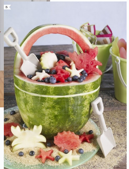
Watermelon Sand Bucket with fruits cut in shapes!