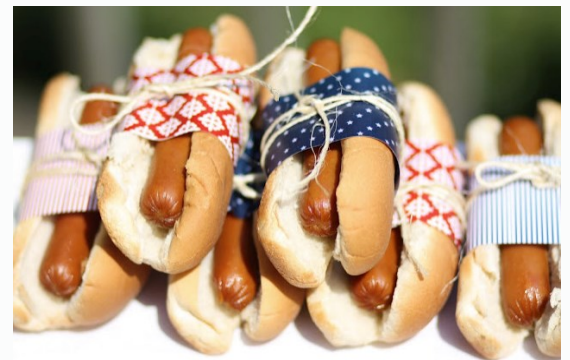
Wrapped Hot Dogs!